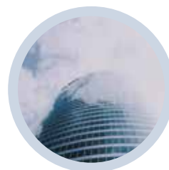
Construction management (turnkey)